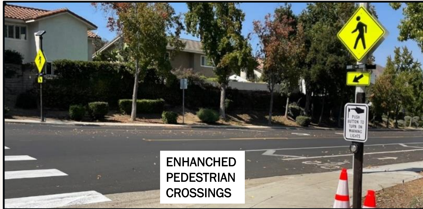
ENHANCED PEDESTRIAN CROSSINGS