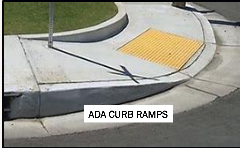
ADA CURB RAMPS