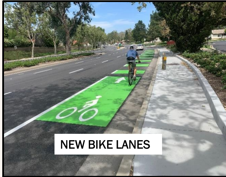
NEW BIKE LANES