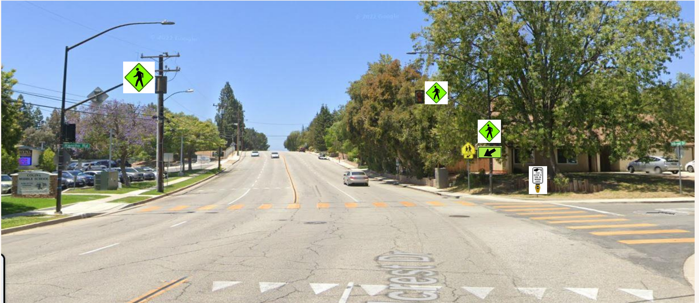
HILLCREST DRIVE - COLINA ELEMENTARY SCHOOL UPGRADES (COMPLETED FALL 2023)